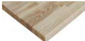
European Ash Character Grade