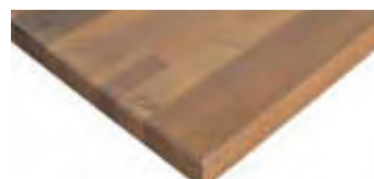
European Walnut Nature Grade