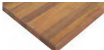
African Iroko Nature Grade