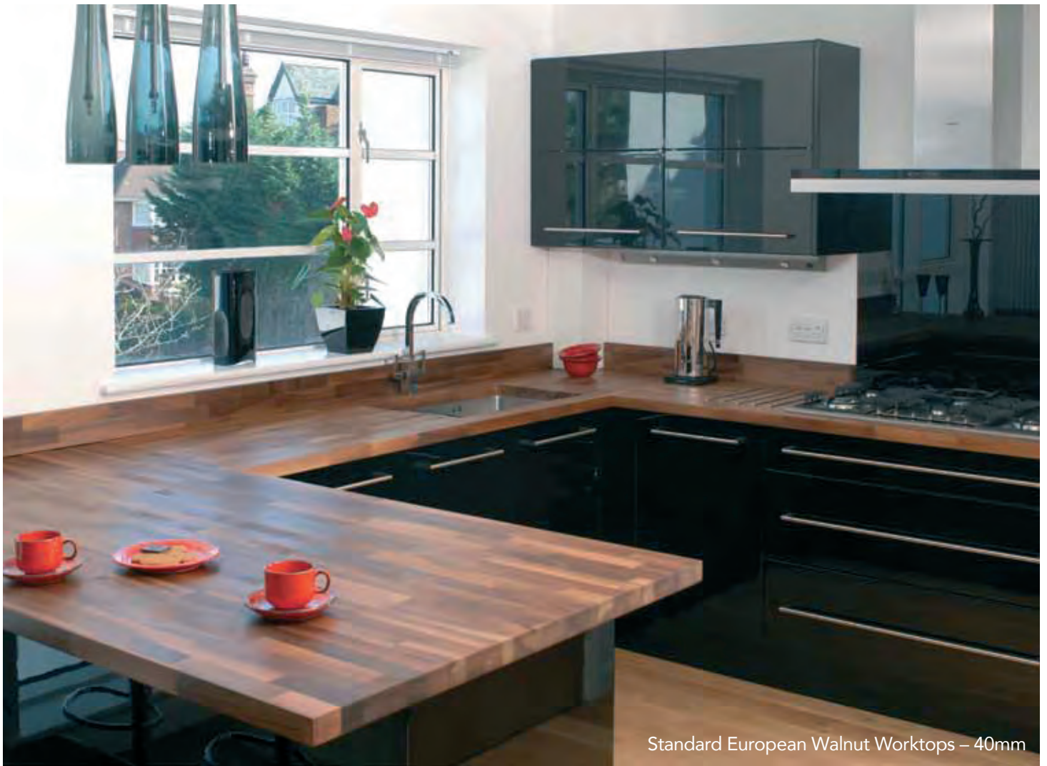
Standard European Walnut Worktops – 40mm