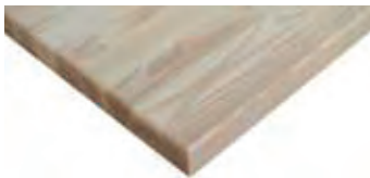
European Ash Prime Grade