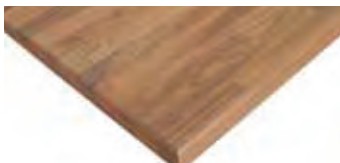
European Cherry Nature Grade