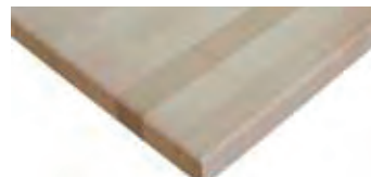
European Maple Nature Grade