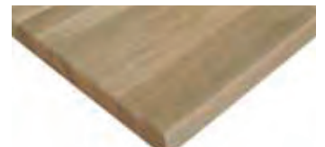
European Oak Prime Grade