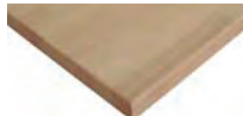
European Beech Prime Grade