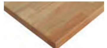
European Beech Character Grade