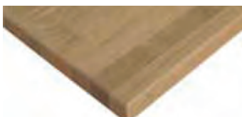
European Oak Character Grade